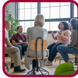
Social Services & Mental Health

We're here to help you expand your offering to nonprofits, giving them the coverage they need with a smoother, faster process. If you're interested in learning more or seeing if we can partner to help your clients, let's chat.