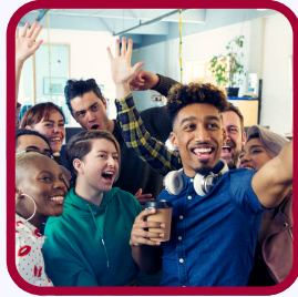
Trusts, Societies, Associations, Clubs