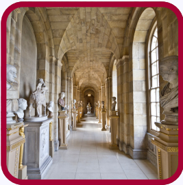
Zoos, Theaters, Museums & Arts