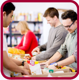
Charities, Co-Ops Orgs & Foundations